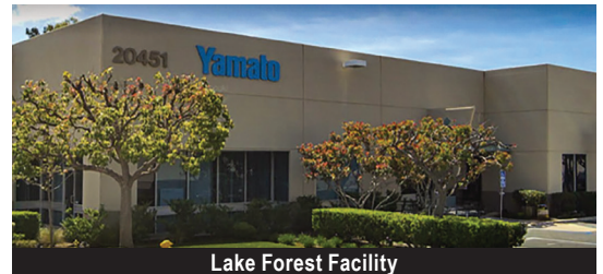
Lake Forest Facility