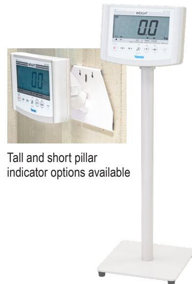
Tall and short pillar indicator options available