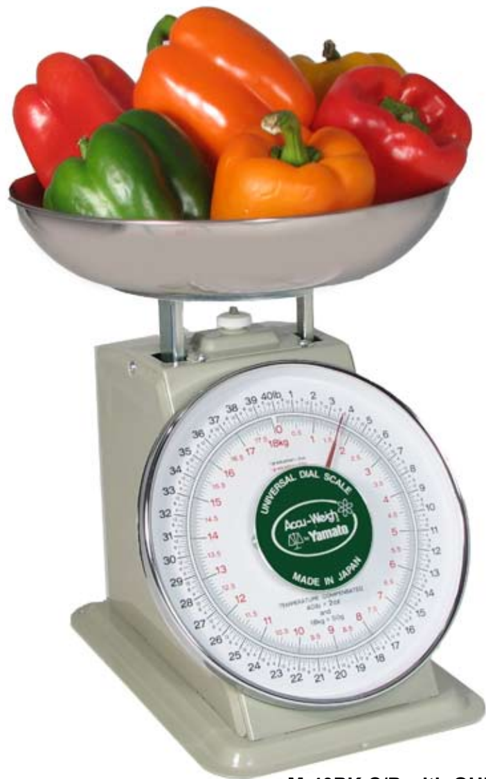
M-40PK C/P with OUD-171