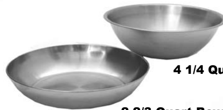
4 1/4 Quart Bowl

*When ordered with scale comes bolted to platform