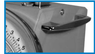
M-PK C/P with handle